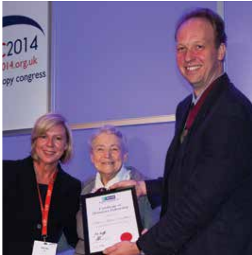
Prof Mildred Dresselhaus, Massachusetts Institute of Technology, USA